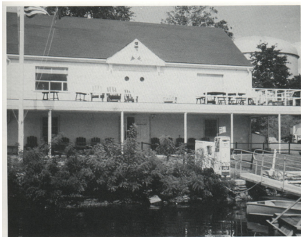
Clubhouse with new porch over the lower deck.